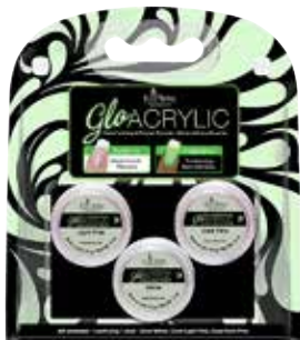
Glo ACRYLIC COLLECTION Item# 59106

EzFlow offers specialty acrylic powder kits ranging from opaque natural colors for creating the perfect Classic French, to glow-in-the-dark powders for creating a trendsetting French. A variety of possibilities for traditional looks, as well as daytime to nighttime fun looks.