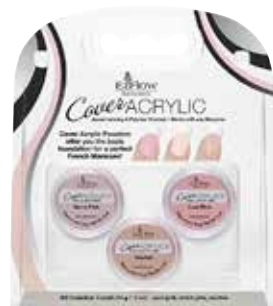
Cover ACRYLIC COLLECTION Item# 59110